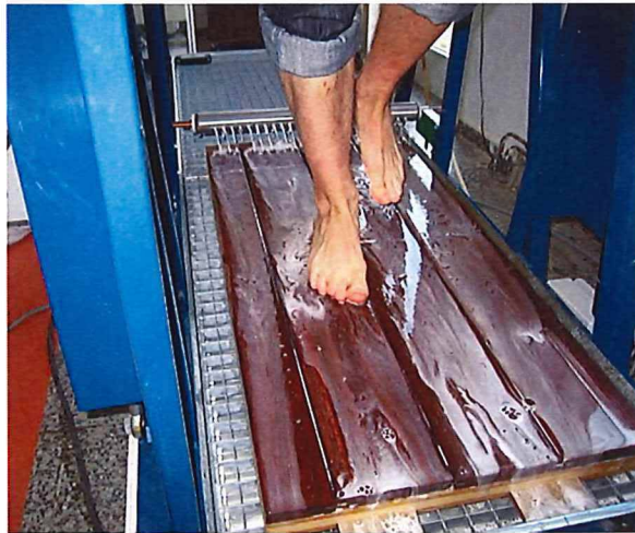
Fig. 2: Wet deck boards during the test on the ramp test

The determination of anti-slip property was carried out with three probands according to DIN 51097:1992 (wet-loaded barefoot areas, walking method - Ramp test) and GUV-I 8527:1999 (see Fig. 2).